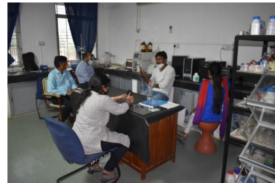
Glimpses of Participants in the Webinar