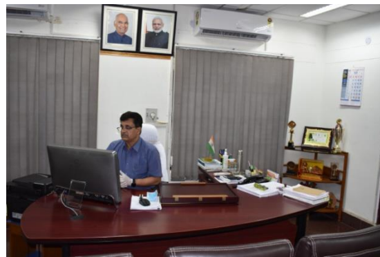
Opening remarks by the Director